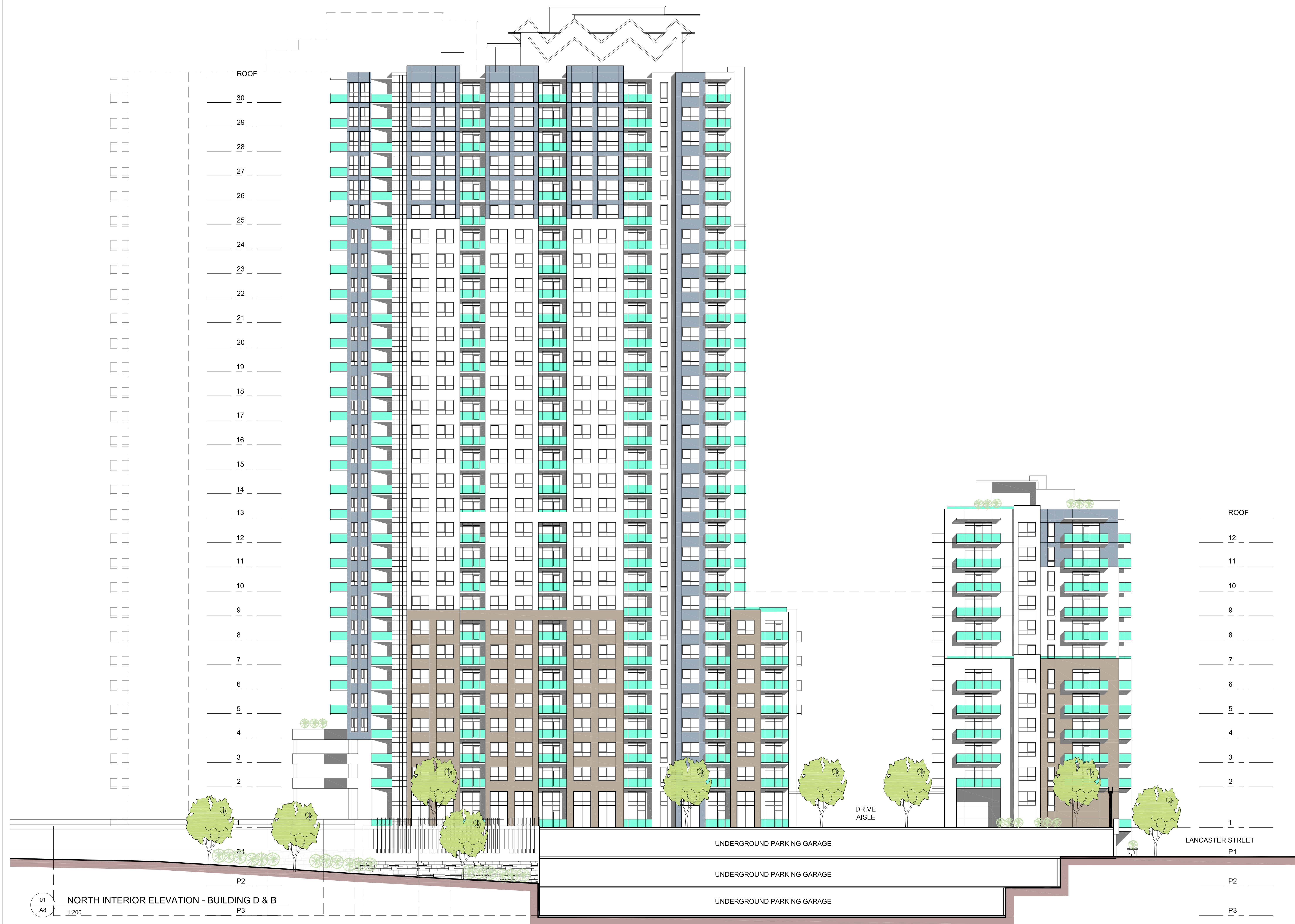
01 A8 1:200 NORTH INTERIOR ELEVATION - BUILDING D & B P2 P3