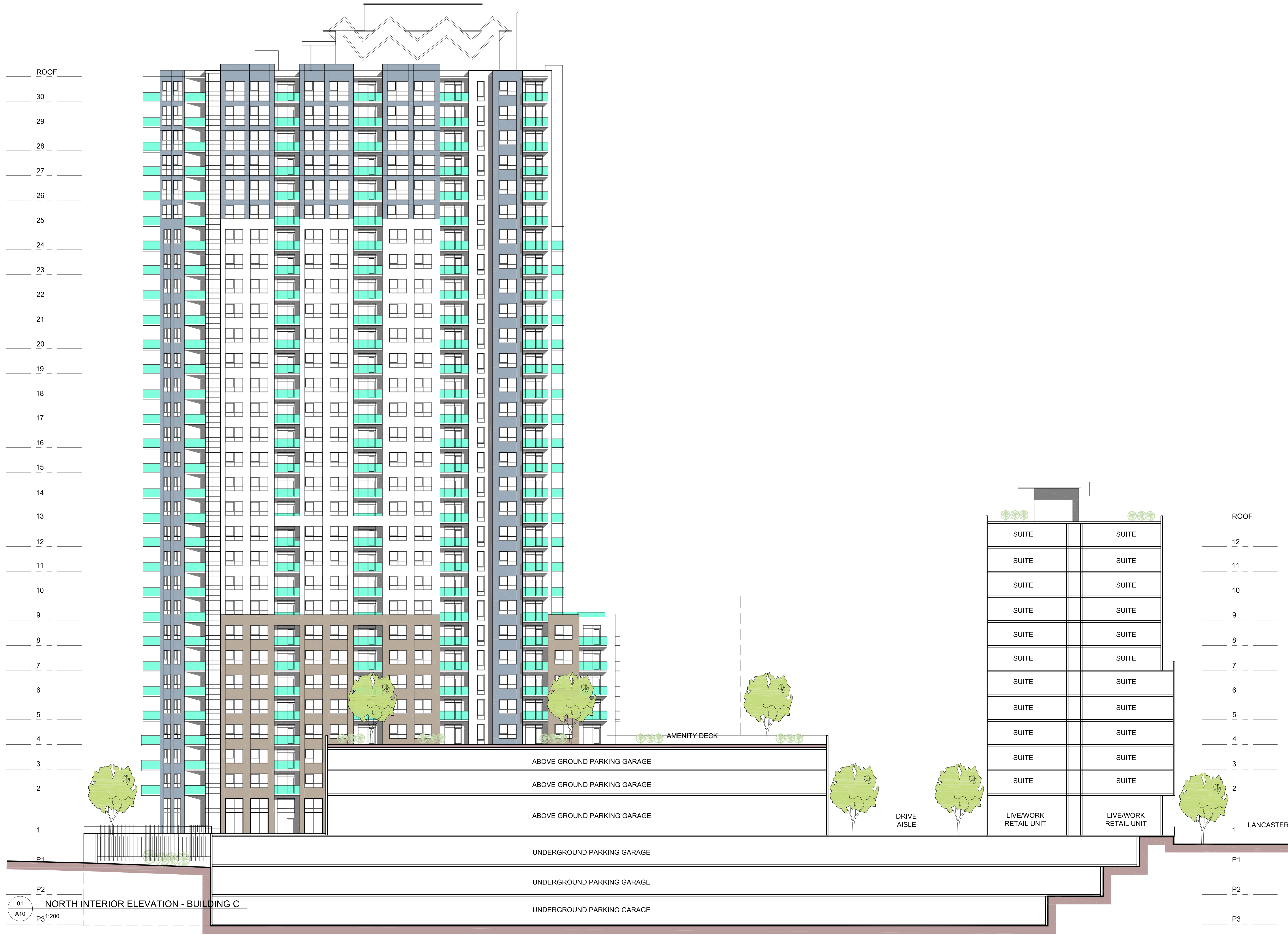
01 NORTH INTERIOR ELEVATION - BUILDING C A10 P3 1:200

This drawing, as an instrument of service, is provided by and is the property of DANIEL L. CUSIMANO, ARCHITECT. The contractor must verify and accept responsibility for all dimensions and conditions on site and must notify DANIEL L. CUSIMANO, ARCHITECT, of any variations from the supplied information. This drawing is not to be scaled. The architect is not responsible for the accuracy of survey, structural, mechanical, electrical, etc., information shown on this drawing. Refer to the appropriate consultant's drawings before proceeding with the work. Construction must conform to all applicable codes and requirements of authorities having jurisdiction. The contractor working from drawings not specifically marked "For Construction" must assume full responsibility and bear costs for any corrections or damages resulting from his work.